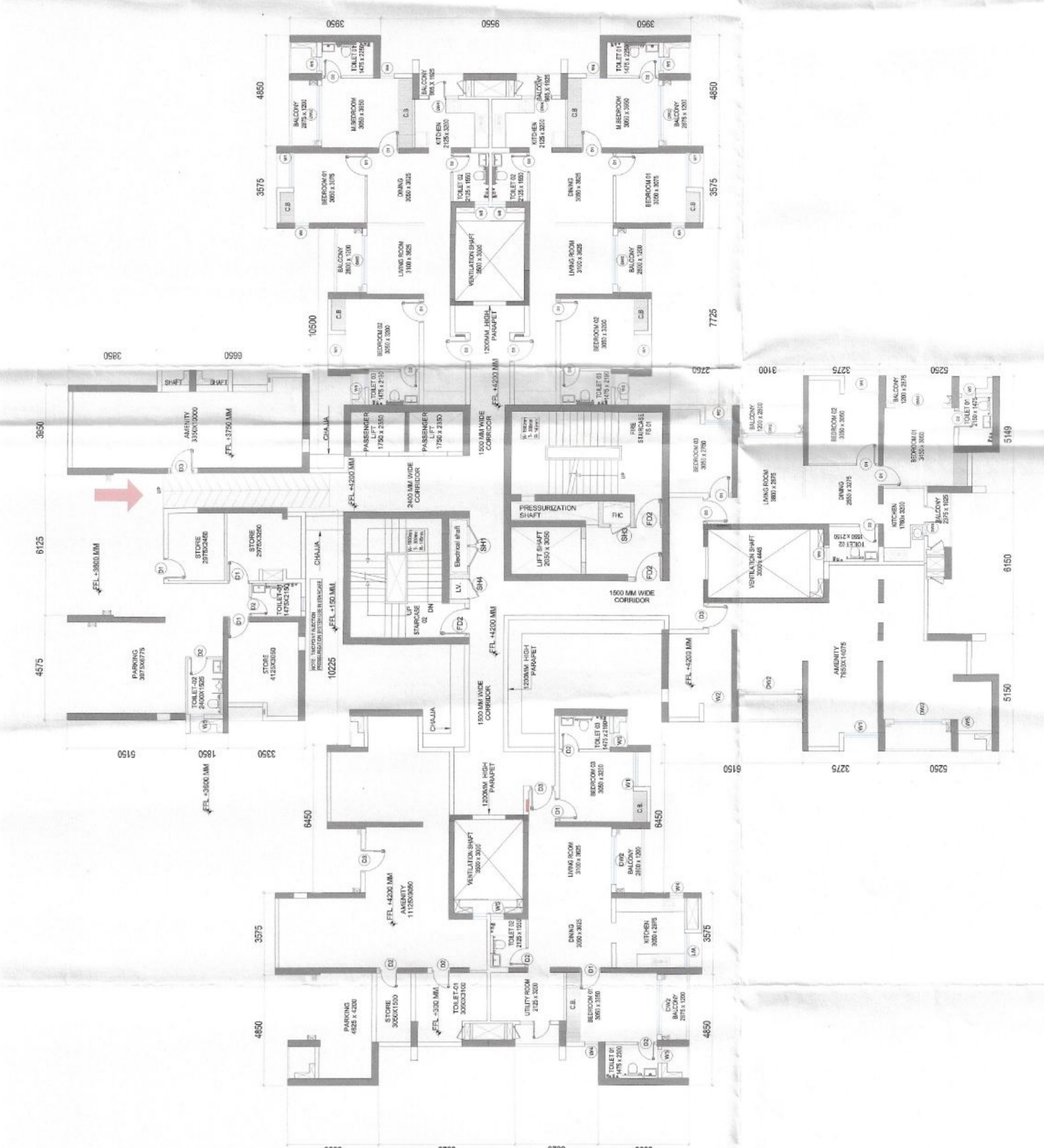
2. TOWER 1 FIRST FLOOR PLAN