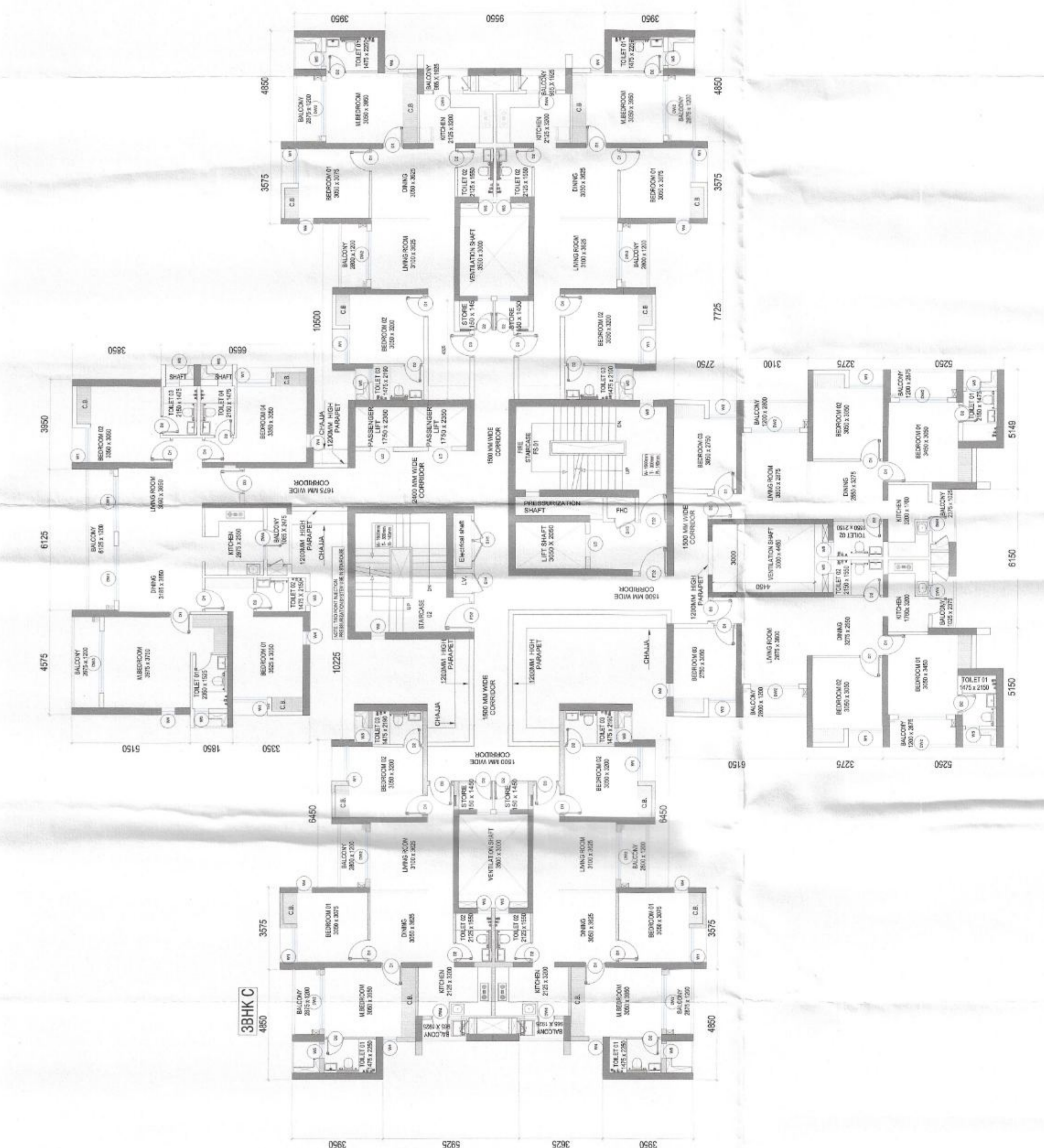
3. TOWER 1 TYPICAL (2nd-7th, 9th-12th, 14th-17th, 19th-22nd, 24th-27th, 29th) FLOOR PLAN

ARCHITECT & SEAL DTC PROJECTS PVT. LTD. 1516 Rajdanga Main Road, Kolkata-700 107. Ph: 9830418657/90 E-MAIL: mmconsultants@gmail.com