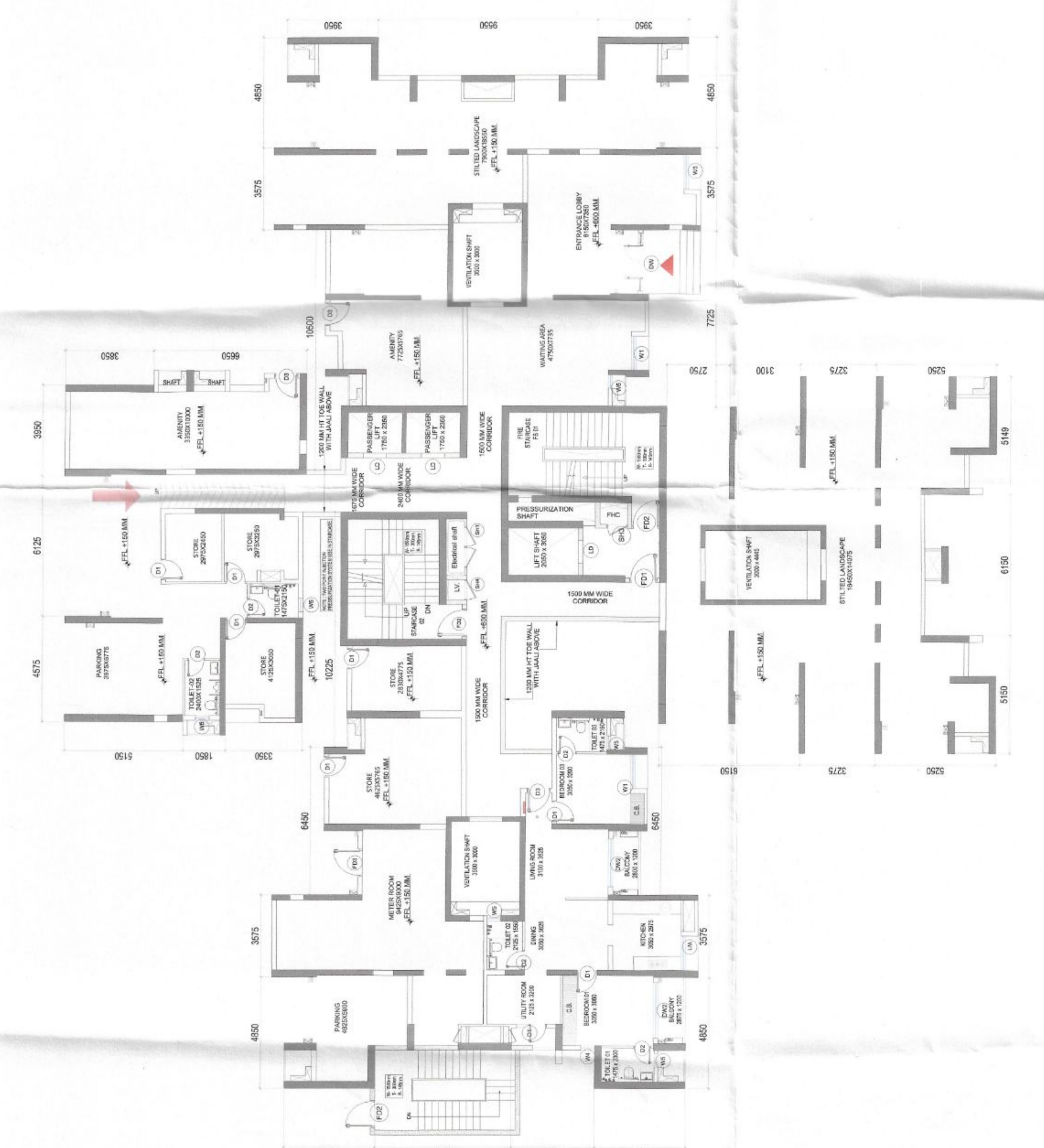
4. TOWER 1 REFUGE (8th, 13th, 18th, 23rd and 28th FLOOR) PLAN